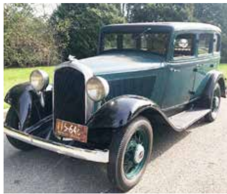
FOR SALE, 1932 Plymouth P B: I have rebuilt the engine. Also the brakes have been rebuilt. She runs great. All original. My price is $ 11,000 cdn . With the American dollar being worth more than the Canadian dollar, this is something to consider. jbaileymed@hotmail.com